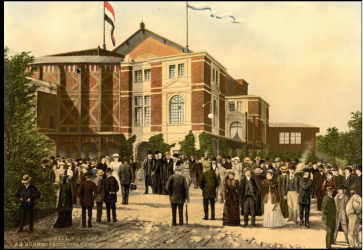
Bayreuth Festival Opening